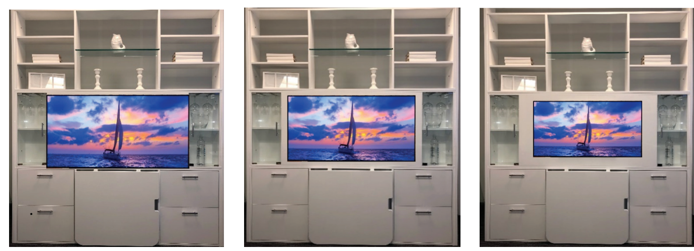
55" TV = 49" X 28"

A. The TV mounting area is 49 \frac{1}{2} \times 28 \frac{1}{2} so it can handle most 55" TV's without conflicting with the glass cabinets – but just. We recommend 43" or 50" TV's